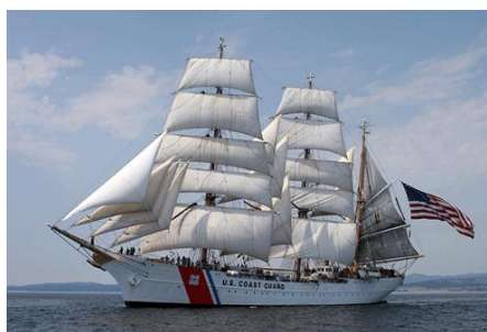
left: archive photo of Barque Eagle

This would have been in 1963 or 1964. We were on station. A bunch of us were hanging out at the fantail gun, enjoying the calm seas, nice weather and sunset. We could see the sail boat off in the distance. One of the officers from the bridge came down and told us it was the 295' Barque Eagle, U.S. Coast Guard training ship out of New London CT. I had a small camera on me so one of the guys cranked the gun around until the crosshairs were on the Eagle. I simply put the camera lens up to the gunsight and clicked. I don't know if the Barque Eagle has ever been put in the crosshairs before, but I bet this is the only photo.