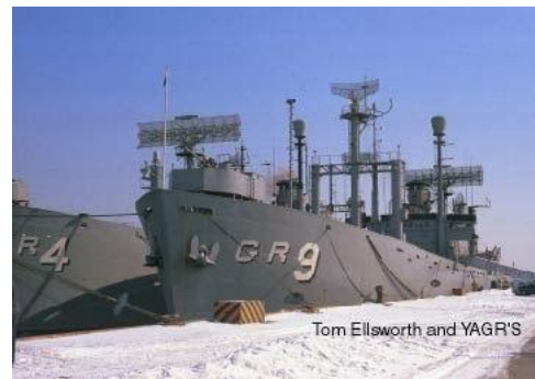
USS Investigator (AGR-9) at Davisville, RI