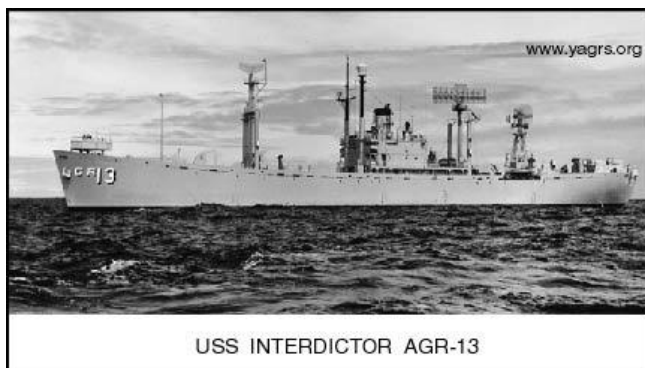
USS INTERDICTOR AGR-13

The way it would work would be that I would have the email address of the coordinators in a group address and would send information to the individual coordinator for further distribution to members of their individual ship. Ideally there would be 16 coordinators but I realize that may not end up being the case. The only duty of the coordinator would be to acquire and maintain email addresses from members of his ship and forward any Association information and activities. It could also be a means of feed back and suggestions relating to the Association activities.