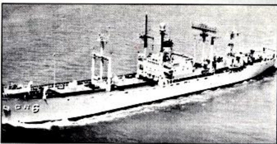
First identified as YAGRs, the designation was shortened to AGR in 1958. USS LOCATOR (AGR-6) recommissioned in January 1956 and retired in August 1965. LOCATOR , like most of her sister-AGRs, was scrapped in the early 1970s. Space satellites replaced the AGRs, rendering them totally obsolete by the mid-'60s.

While records are unclear whether both commands operated concurrently or if one handled the East Coast and the other the West Coast, records