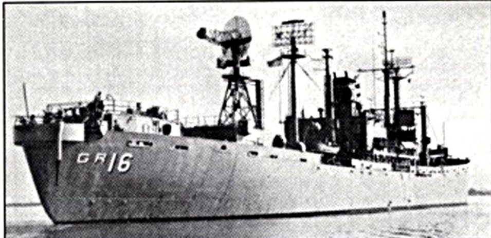
A stern view of USS WATCHMAN (AGR-16) shows the aft radar array to good advantage. They carried crews of 151, including 13 officers, who would rotate on 35-day patrols to predesignated sectors approximately 500 miles off the coast. WATCHMAN had the unique distinction of having a basketball half-court installed in her forward hold. Because of the length of their patrols the AGRs were fitted with excellent habitability for officers and enlisted men.

based its radar planes, EC-121 Super Constellations, at McClellan Air Force Base, California, while those on the East Coast flew from Otis Air Force Base, Massachusetts. Usually word of a mail drop came from Combat Information Center where radar operators sat in front of large radar screens scanning the skies. And from that moment, nearly every crewman off duty would venture topside to scan for the radar plane popping over the horizon.