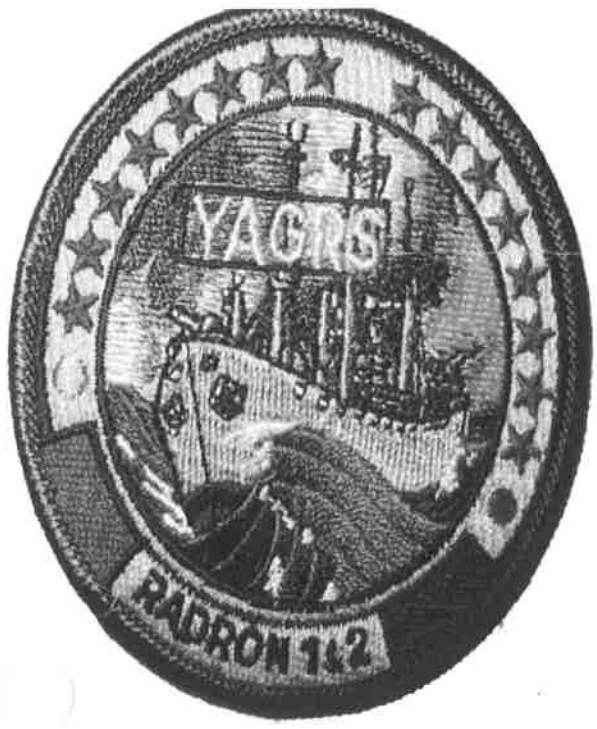
3 inch YAGR'S embroidered logo patch in color.

The YAGRS logo patch is the only item we have for sale from the ships store.