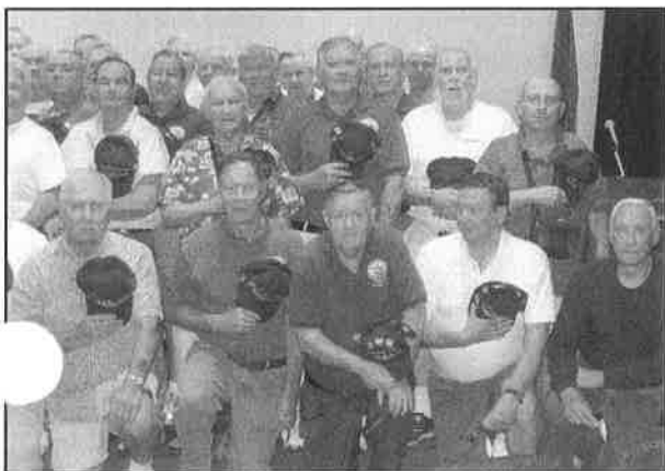
Some of the 67 crewmen who attended the Plaque dedication.

Shown below is the new plaque that will be on display. YAGR'S thanks Lee Doyle (AGR-15) for donating the funds for the plaque.