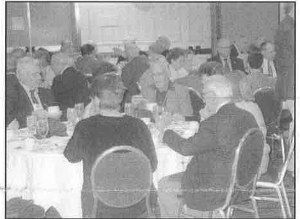
One of the 24 tables we had at the banquet.